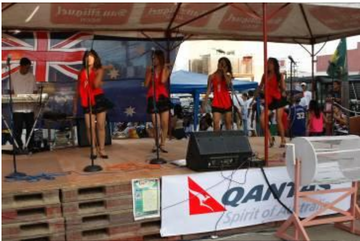
The Lipsticks singing and Dance group entertaining the multitude at the Premier Performance on 25 January